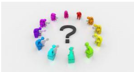
CCO Public Domain